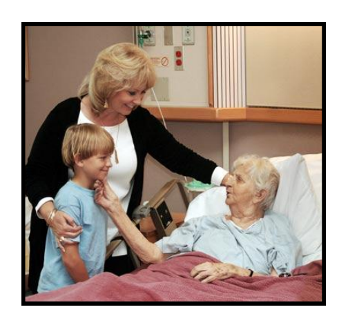
If Your Loved One Isn't Eating