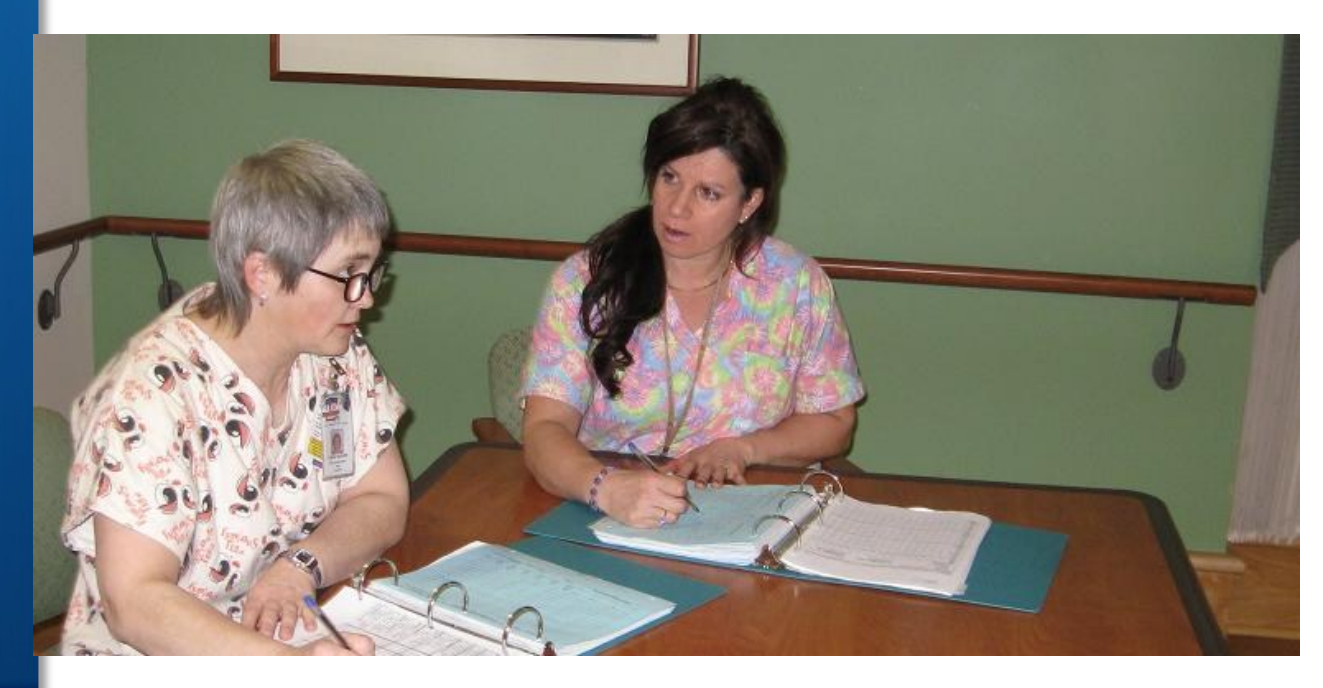
Quality Palliative Care in Long Term Care Alliance, Version #1